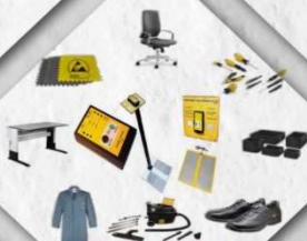
ESD CONTROL & CLEAN ROOM