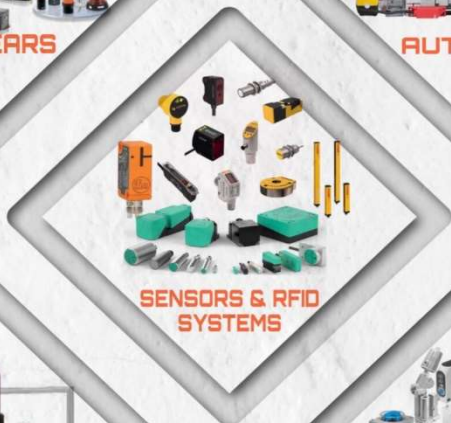
SENSORS & RFID SYSTEMS