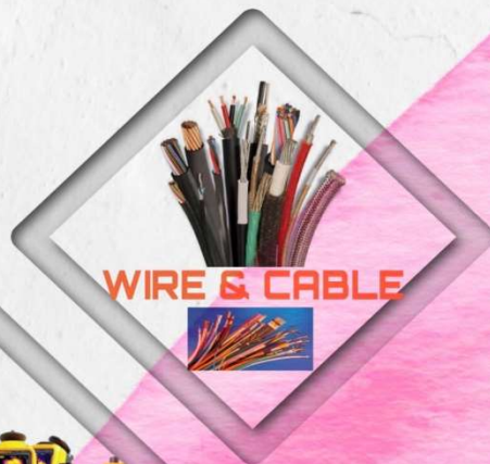
WIRE & CABLE