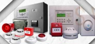
FIRE ALARM SYSTEMS