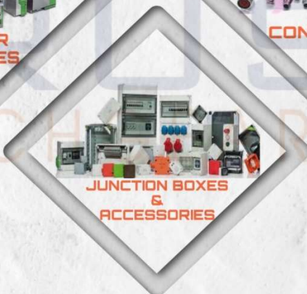
JUNCTION BOXES & ACCESSORIES