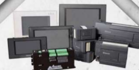
HMI & PLC

1801, 2nd Floor, Bhagirath Palace, Delhi - 110006