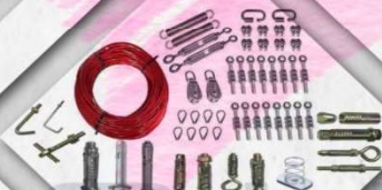
FASTENERS & FIXINGS