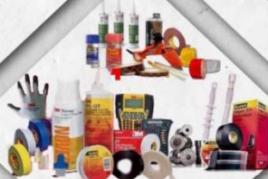
ADHESIVE, SEALANTS & TAPES