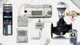
HVAC & THERMAL MANAGEMENT