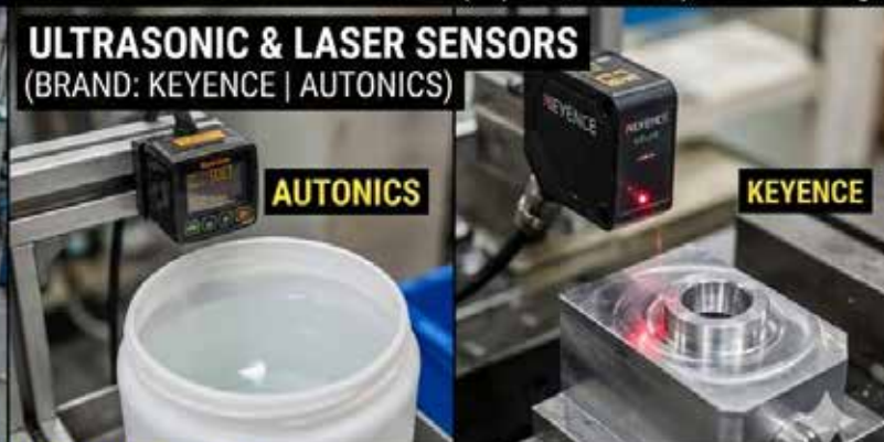
ULTRASONIC & LASER SENSORS (BRAND: KEYENCE | AUTONICS)

PHOTOELECTRIC: High-speed counting & Position detection (SICK W16)