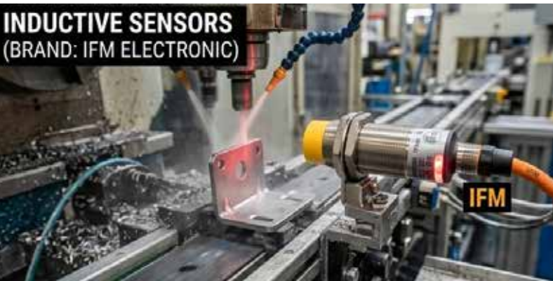
INDUCTIVE SENSORS (BRAND: IFM ELECTRONIC)

"Ensuring zero-downtime through reliable sensing."