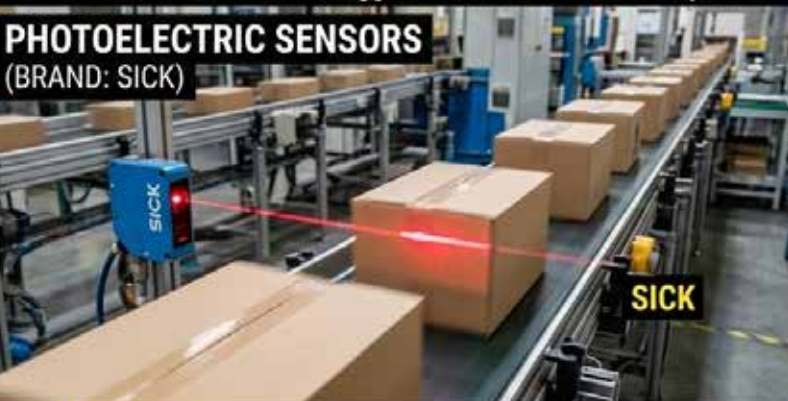
PHOTOELECTRIC SENSORS (BRAND: SICK)

CAPACITIVE: Detect Non-metallic (Liquids/Powders) Level Sensing