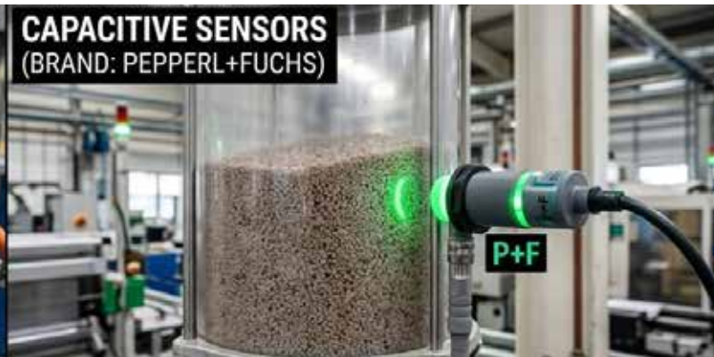
CAPACITIVE SENSORS (BRAND: PEPPERL+FUCHS)

INDUCTIVE: Non-contact, Rugged detection of Metallic objects.